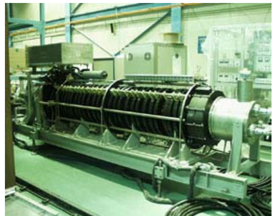
Figure 2: 1 MW 350 MHz Klystron