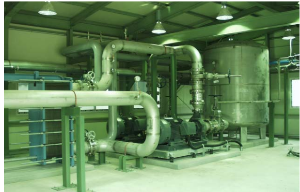
Figure 5: 2 MW DI water cooling system

A 2 MW DI water cooling system for KTF RFQ and RF system was prepared already as shown in Figure 5. The required cooling loops for RF system are circulator, RF load, RF window cooling loops and body, cavity, collector cooling loops for klystron. Because the coolant of the RF load is a mixture of water and ethylene glycol, a separate cooling loop for RF load with storage tank, pump and heat exchanger was installed. Also pump for pressurization was installed in klystron body cooling loop, because the pressure of the DI water cooling loop was too low to supply enough flow to that cooling loop.