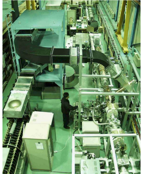
Figure 1: KTF RFQ RF system

The KTF RFQ RF system utilizes a 1 MW CW klystron at 350 MHz. The klystron was manufactured by THALES Electron Devices and is shown in Figure 2. The klystron has a triode type electron gun to control the beam current and is capable of dissipating the full beam power (1800 kW). It could deliver RF power up to 1.1 MW into the load of a VSWR 1.2:1 at 350 MHz during the acceptance test at THALES Electron Devices last year. It is now installed at KAERI KTF site and being high power tested. In order to protect personnel from X-ray, additional 2 mm thick lead shield - besides the lead shielding in the collector zone - around the klystron was installed.