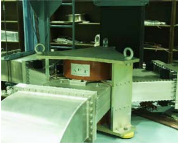
Figure 4: 1.3 MW, 350 MHz Y-junction circulator

A 350 MHz Y-junction type circulator, which can deliver 1.3 MW CW RF power for forward direction and permit 1.3 MW reverse power at any phase, was used. The circulator has been manufactured by Advanced Ferrite Technology (AFT). It uses temperature compensating system to compensate the temperature dependent ferrite saturation magnetization. It was installed at KTF site as shown in Figure 4.